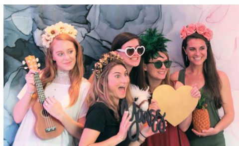
Attendees enjoy the photo booth at the 2018 I Do event